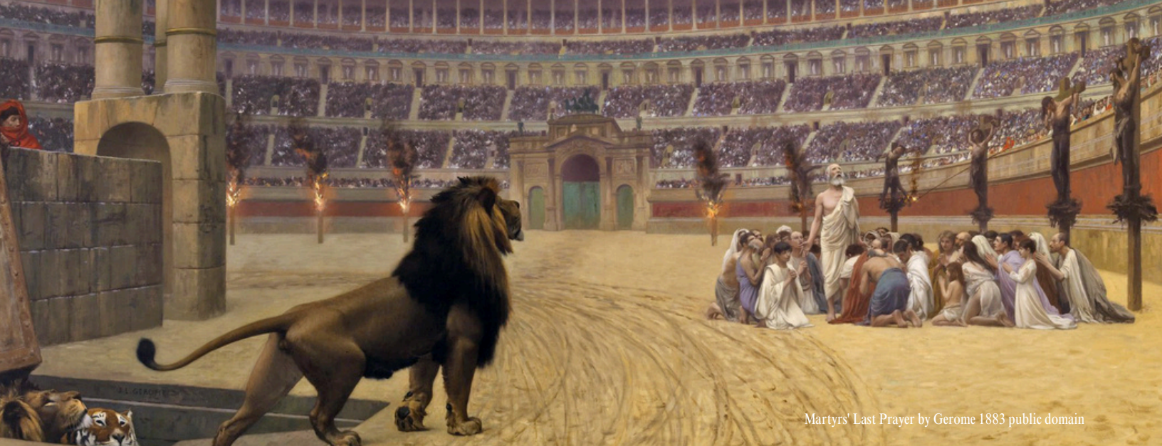
Martyrs' Last Prayer by Gerome 1883 public domain