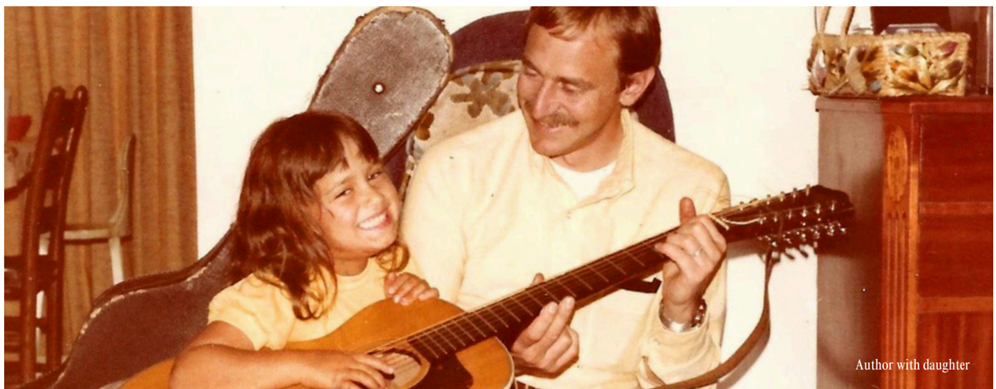
Author with daughter

More than ever before, we are called to be the “family of God.” May our homes and congregations reflect the reality of “children like olive plants all around your table.”