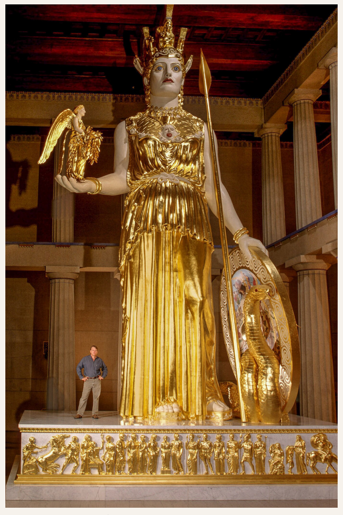
Replica of 5th Century BCE Athena Parthenos idol at original size - by LeQuire

The Scriptures present an open-eyed look at life and its physical necessities. 1 Corinthians 6 tackles the power of both food and sex to enslave us. These basic aspects of life are not labeled as "evil" or "not to be enjoyed." Our physical body is part of how God made us, and is meant to glorify Him and help us connect with God. Our flesh is not meant to separate us from the Lord.