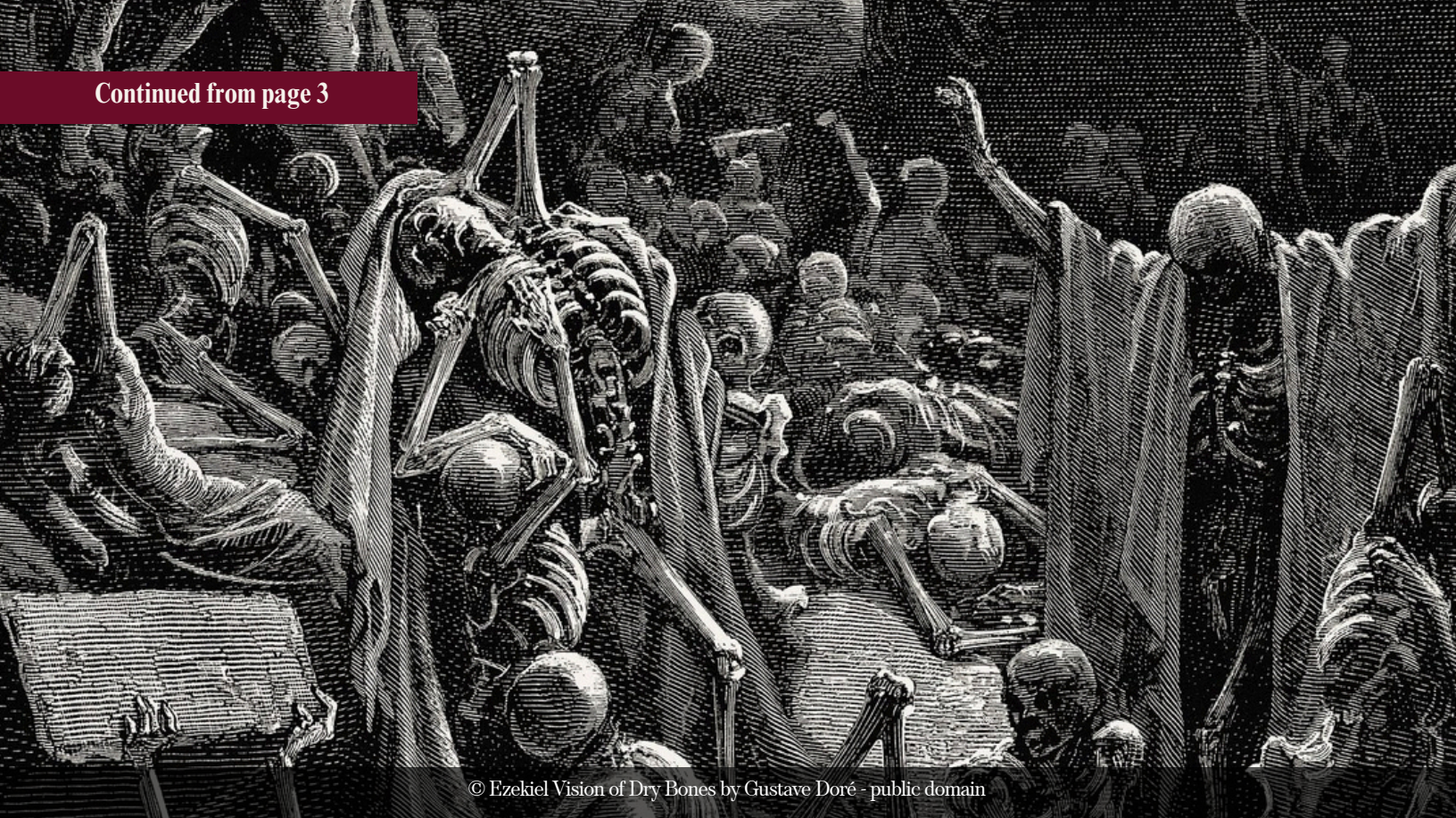
© Ezekiel Vision of Dry Bones by Gustave Doré - public domain

A parable that Yeshua taught comes to mind – the new and old wineskins . Our lives can be compared to wineskins. We carry in ourselves, body, soul and spirit, the things we experience in life. As we process and respond to the “cup” we have been poured, it is our challenge to flex and accommodate the contents so that we don’t crack and break.